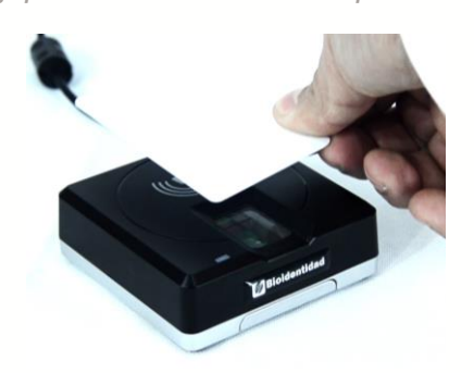
The FS26 reads and writes Mifare proximity cards quickly and without contact.